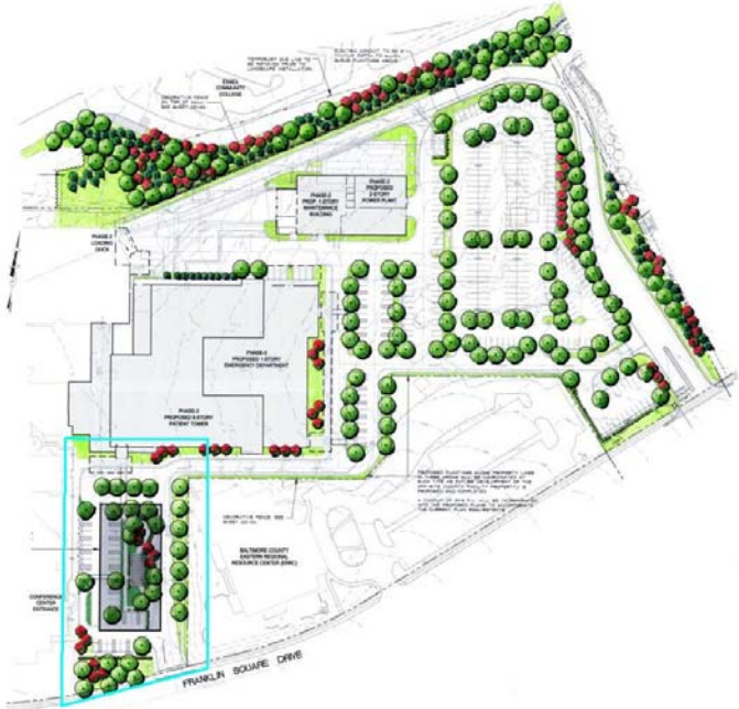
Fig. 4: Main entrance and parking lot outlined in cyan in the bottom left (dwg L0-1)

The main entrance to the new addition has a drop off area where cars can pull up to the front doors under a canopy. There is also a parking lot adjacent to the canopy (Fig. 4) that will be part of the outdoor space study.