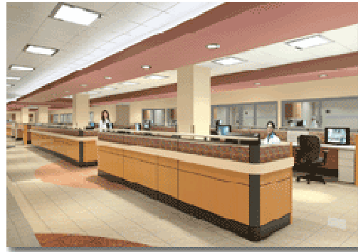
Fig. 1: Nurse Station ( http://www.franklinsquare.org )

The visual tasks within the nurse station include reading, writing and computer usage. Important Design issues are modeling of faces, reflected glare and uniform light distribution on task plane.